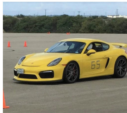
Chris Upton - 3rd Place