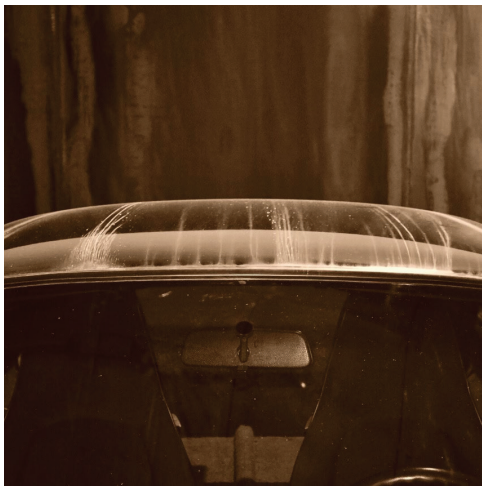
Top of Eric Kelner's car after the rain.

Roundtop is one end of the antiques alley that runs up Hwy 237 from La Grange. Visitor's got to see a dozen beautiful antique Porsches, including a Werks Reunion winning 912, a 356 coupe and a 356 cabriolet, and two other 912s. Lunch at Royer's is always a treat. You can't leave without having pie and ice cream, and the waitresses call you "Honey" without being accused of sexual harassment. God bless Texas, and God bless old Porsches, still roaring after all these years.